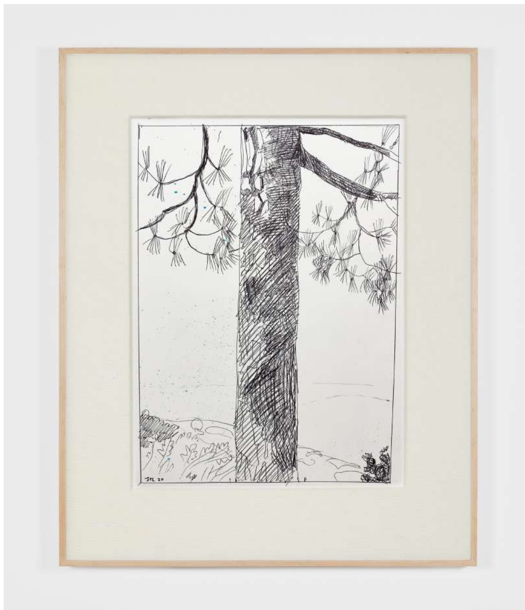
Untitled Tree Study 5 , 2020 ink on paper 14 5/8 x 11 3/8 in, framed 37.1 x 28.9 cm, framed (JLO20.040) $2,500.00 SOLD