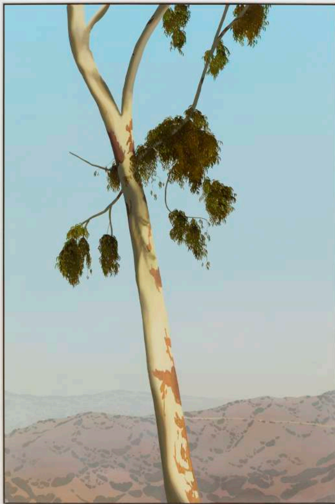
In Glendale (Eucalyptus 5) , 2020 Oil on muslin 84 x 57 in (85 x 57.25 in, framed) 213.4 x 144.8 cm (216 x 145.5 cm, framed) (JLO20.004)