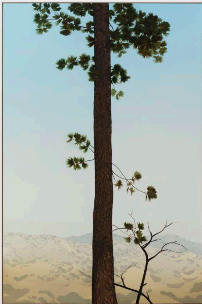
In Glendale (Pine 4) , 2020 Oil on muslin 84 x 57 in (85 x 57.25 in, framed) 213.4 x 144.8 cm (216 x 145.5 cm, framed) (JLO20.006)