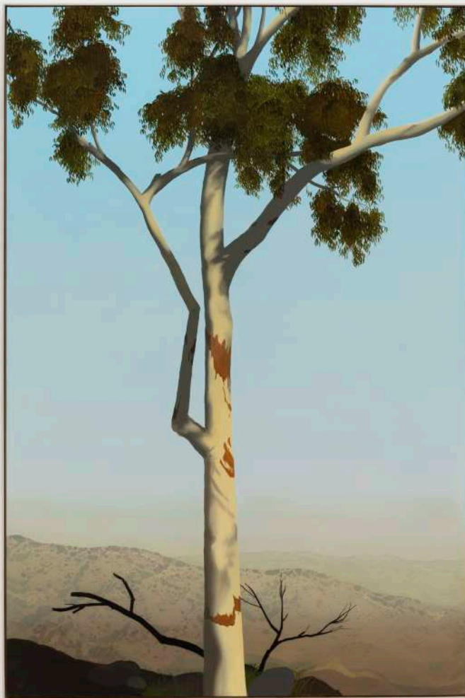
In Glendale (Eucalyptus 3) , 2020 Oil on muslin 84 x 57 in (85 x 57.25 in, framed) 213.4 x 144.8 cm (216 x 145.5 cm, framed) (JLO20.007)