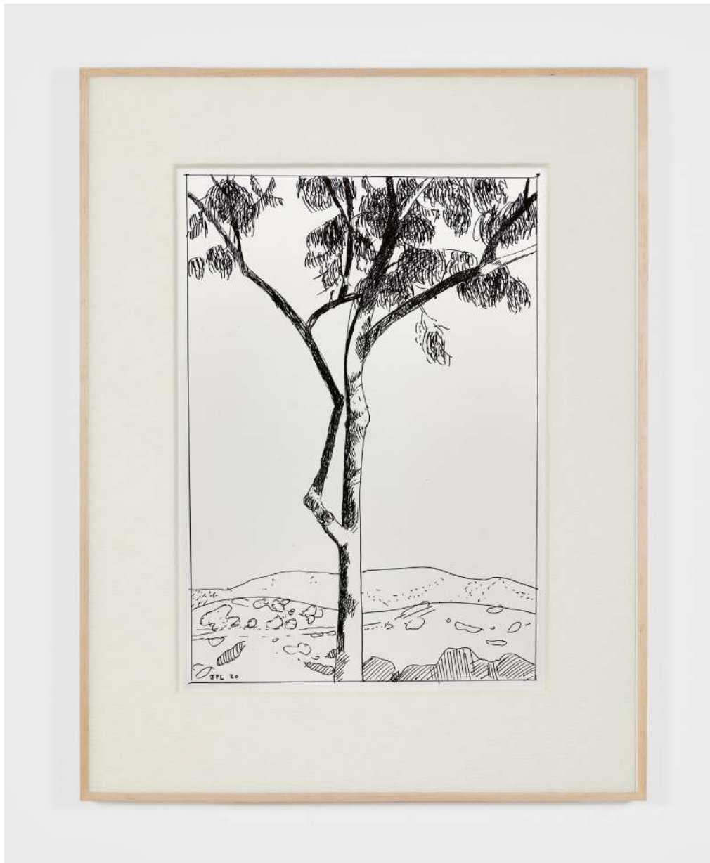
Untitled Tree Study 4 , 2020 ink on paper 14 5/8 x 11 3/8 in, framed 37.1 x 28.9 cm, framed (JLO20.041) $2,500.00