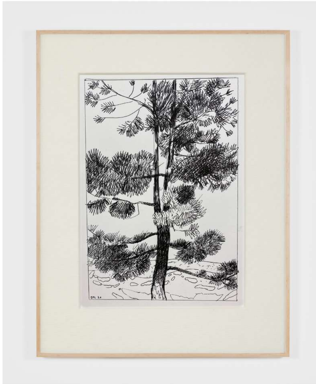
Untitled Tree Study 2 , 2020 ink on paper 14 5/8 x 11 3/8 in, framed 37.1 x 28.9 cm, framed (JLO20.043) $2,500.00