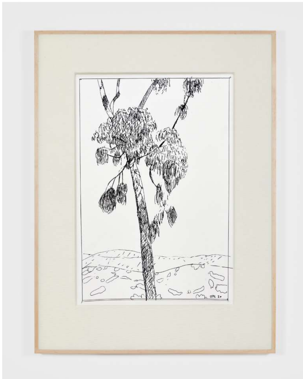
Untitled Tree Study 6 , 2020 ink on paper 14 5/8 x 11 3/8 in, framed 37.1 x 28.9 cm, framed (JLO20.039) SOLD