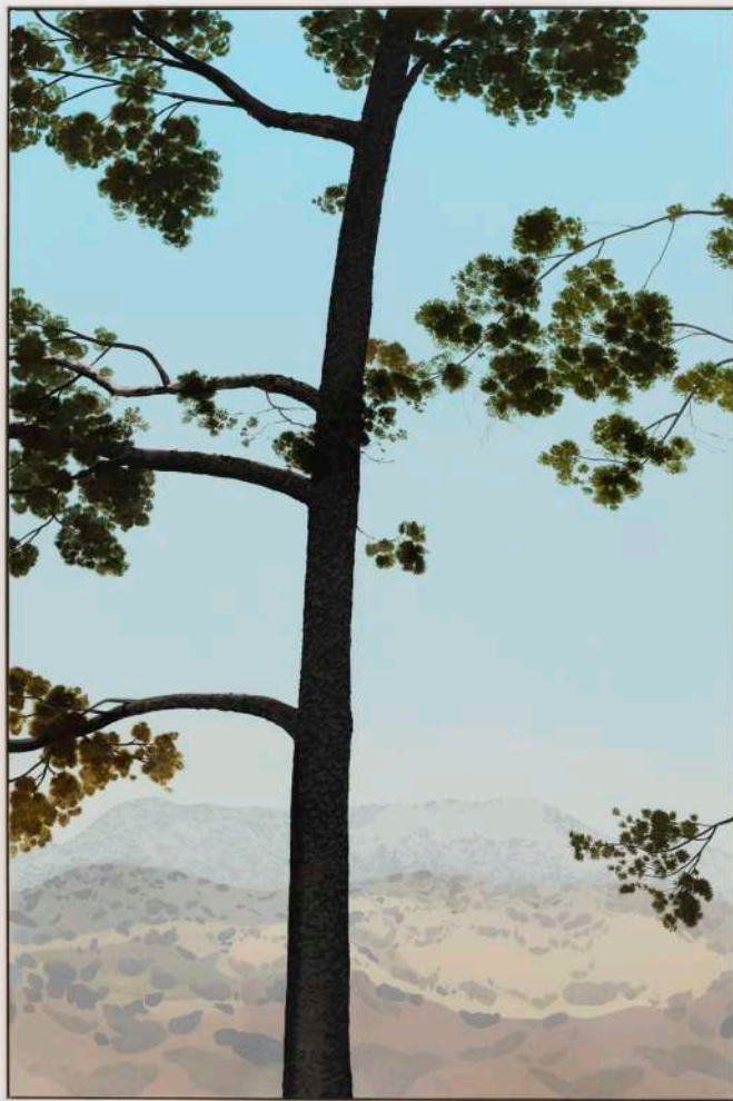
In Glendale (Pine 5) , 2020 Oil on muslin 84 x 57 in (85 x 57.25 in, framed) 213.4 x 144.8 cm (216 x 145.5 cm, framed) (JLO20.003)