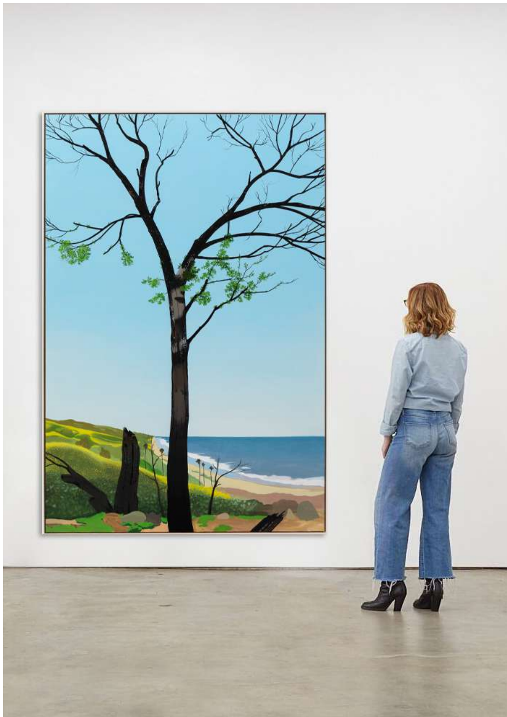
In Malibu (New Growth 2), 2020 Oil on muslin 84 x 57 in (85 x 57.25 in, framed) 213.4 x 144.8 cm (216 x 145.5 cm, framed) (JLO20.002)