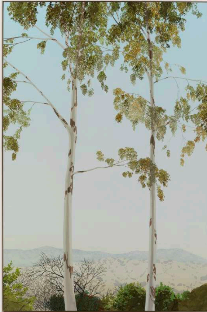
In Glendale (Eucalyptus 4) , 2020 Oil on muslin 84 x 57 in (85 x 57.25 in, framed) 213.4 x 144.8 cm (216 x 145.5 cm, framed) (JLO20.005)