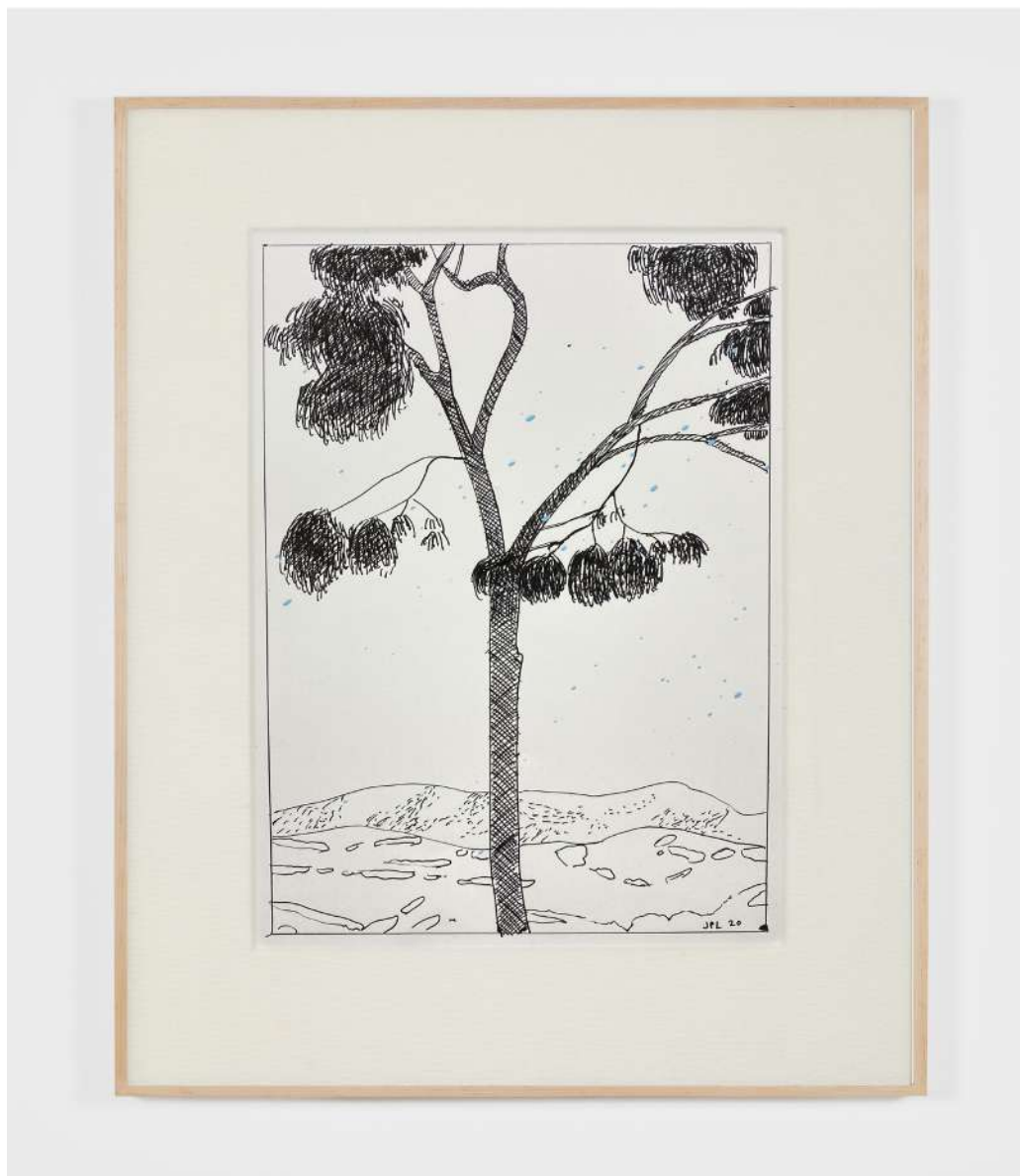
Untitled Tree Study 3 , 2020 ink on paper 14 5/8 x 11 3/8 in, framed 37.1 x 28.9 cm, framed (JLO20.042) $2,500.00 SOLD