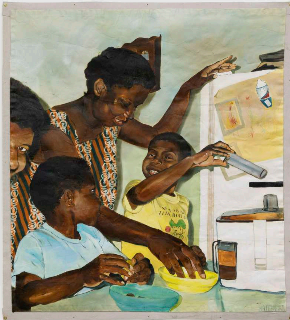
Small appliances that help us fit, 2020 Oil, mixed media, canvas 72 x 66 in, 182.9 x 167.6 cm (KFE20.006)