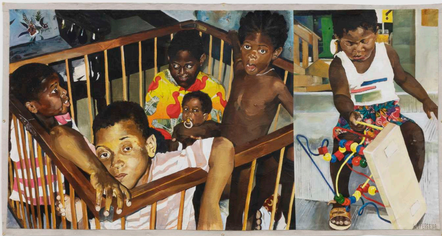
Mess Around Mess About , 2020 Oil, mixed media, canvas 72 x 137 1/4 in, 182.9 x 348.6 cm (KFE20.001)