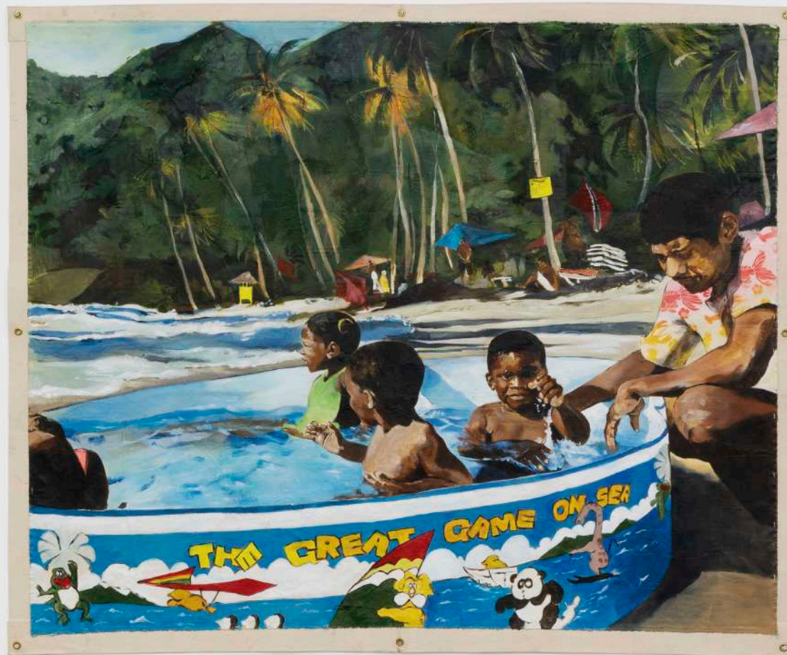
Day At Our Beach, 2020 Oil, mixed media, canvas 62 3/4 x 75 1/4 in, 159.4 x 191.1 cm (KFE20.004)