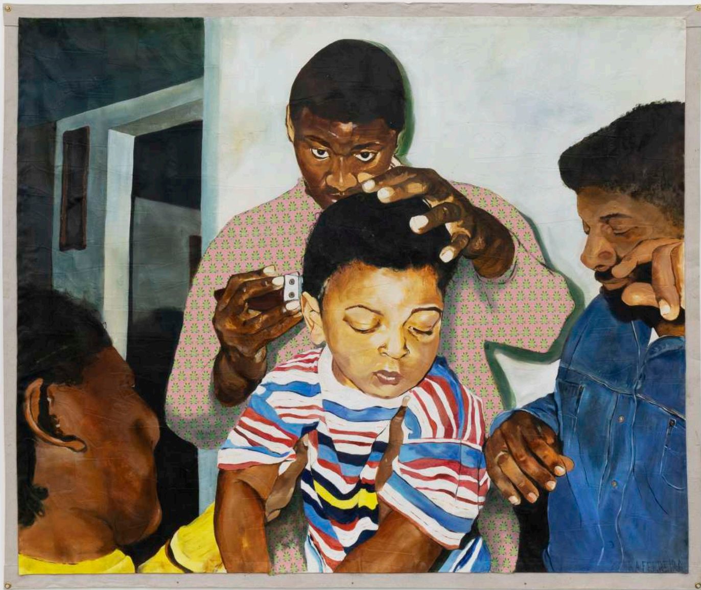
House Calls From Uncle Sean , 2020 Oil, mixed media, canvas 72 x 85 1/2 in, 182.9 x 217.2 cm (KFE20.003)