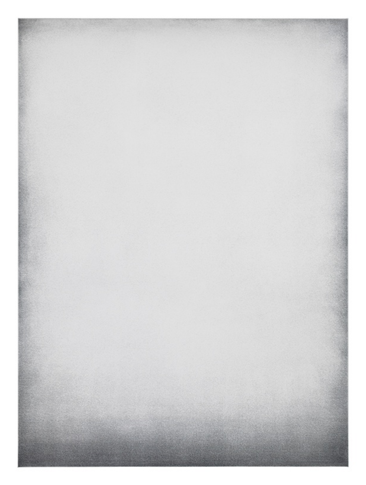
Thomas Wachholz "WHITEOUT" installation views at Nymphius Projekte, Berlin, 2015.