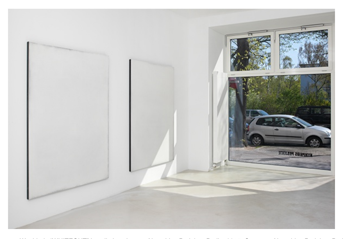
Thomas Wachholz "WHITEOUT" installation views at Nymphius Projekte, Berlin, 2015.

WHITEOUT is a natural condition, found in polar regions, in which uniform illumination from snow on the ground and from a low cloud layer makes features of the landscape indistinguishable, causing a loss of orientation. WHITEOUT also refers to Thomas Wachholz' technique of whiting out the color on the canvas with ethanol.