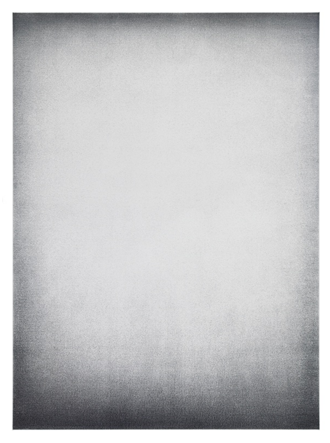
Thomas Wachholz "WHITEOUT" installation views at Nymphius Projekte, Berlin, 2015.