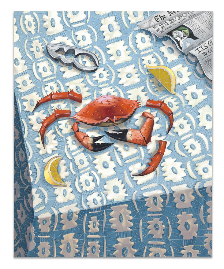
Nikki Maloof, "Dismemberment," 2020, Oil on canvas, 62 x 50 in © NIKKI MALOOF

Fish of all types appear in the paintings — dismembered and disemboweled fish, fish on plates, fish on ice, fish in frying pans. The fish are joined by other marine creatures such as sea urchins, octopus and crabs. Even though fish are everywhere in the paintings, they aren't the subject. The subject, instead, seems to be Maloof's consciousness—that of a painter and mother of two young daughters, trying to keep her shit together under insanely stressful circumstances, and managing, just barely. But so beautifully, as well.