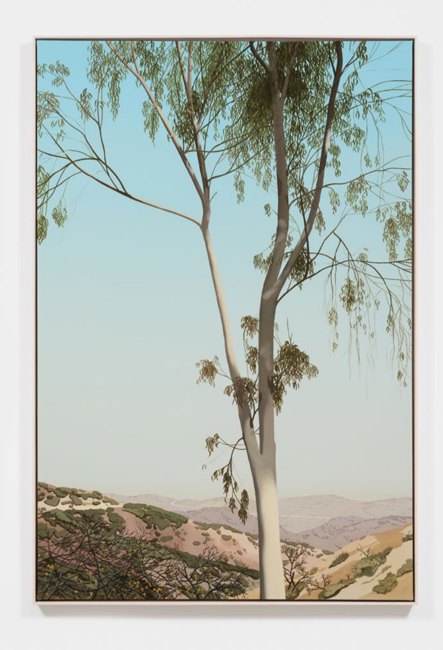
Untitled (Eucalyptus) , 2022 | Oil on muslin | 60 x 40 in, 152.4 x 101.6 cm | (JLO22.015)